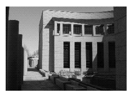
Minnesota Judicial Center, St. Paul

The Supreme Court grants review of approximately 12 percent of the 600-700 petitions it receives each year. The Court hears appeals from the Minnesota Court of Appeals, the Workers' Compensation Court of Appeals, the Tax Court, as well as election matters. The Court also automatically hears all first-degree murder appeals from the district courts.